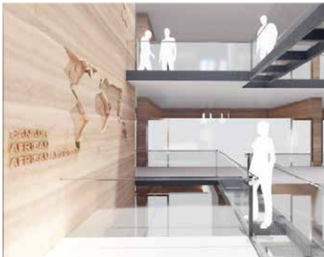
Nicole Sarmiento's rendering of an atrium space

And while the work of the studio will remain on paper each design proposal provoked lively discussions and revealed the significance of international education and research at UB. 🌐