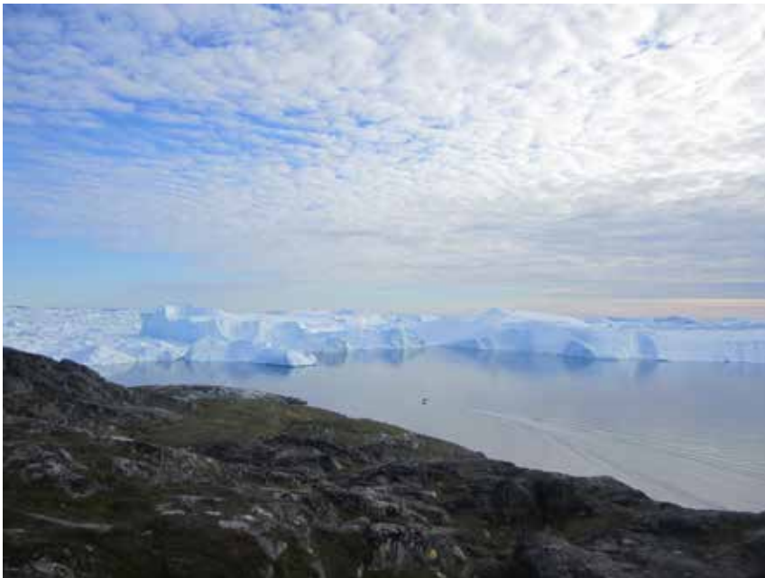
Jakobshavn Glacier in Greenland (Thomas Overly)

Edwards is the lead author on the paper, "Projected land ice contributions to twenty-first-century sea level rise," and worked with more than 80 authors internationally.