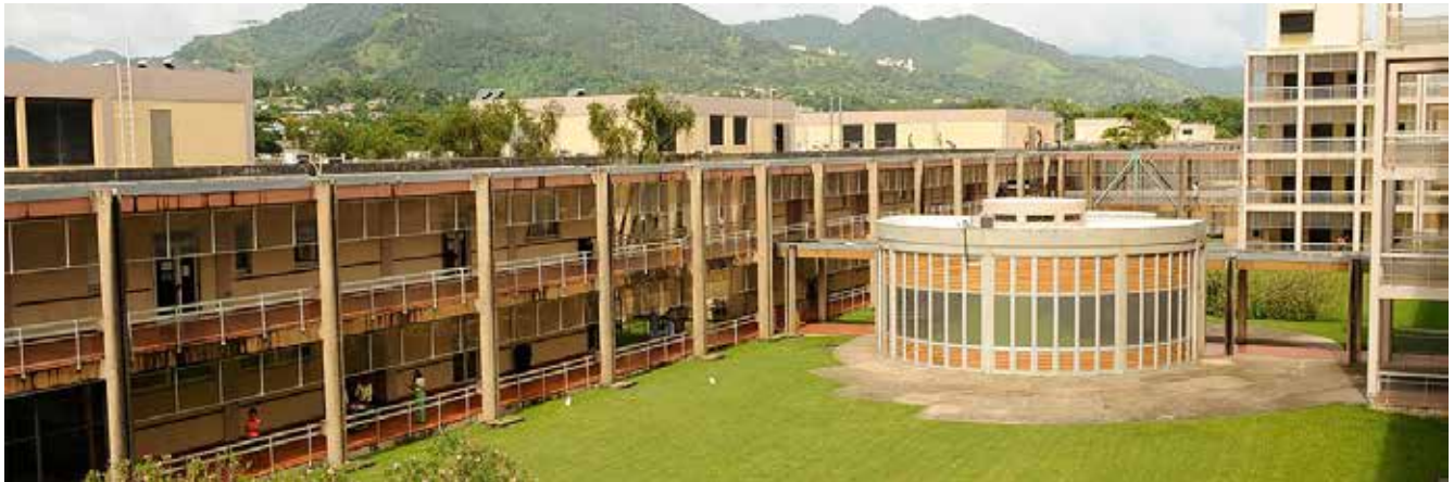
The Faculty of Medical Sciences at UWI in St. Augustine

The alliance will strengthen international collaboration in viral research and response to pandemics, and create a broader hub for global biomedical sciences collaboration in the Caribbean region.