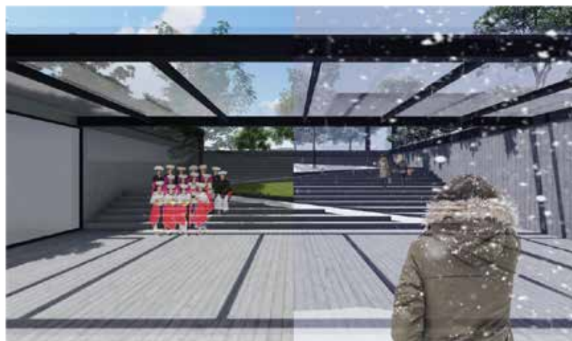
Nicole Sarmiento's rendering of a student courtyard in winter

Students worked together and with faculty to outline requirements for a new building to integrate UB's interna-