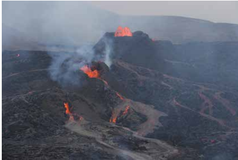
Lava flows at Fagradalsfjall in April 2021