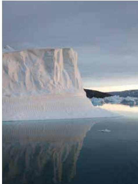
An iceberg in Greenland (Donald Slater)

This statistically-based study updates the scenarios, and combines all sources of land ice into a more complete picture that predicts the likelihood of different levels of sea level rise.