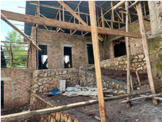
The coffee cooperative under construction

The project — situated on Idjwi Island in the Lake Kivu region of the DRC — is being led by University at Buffalo architects and experts in inclusive design, and the Massachusetts-based Polus Center for Social & Economic Development.